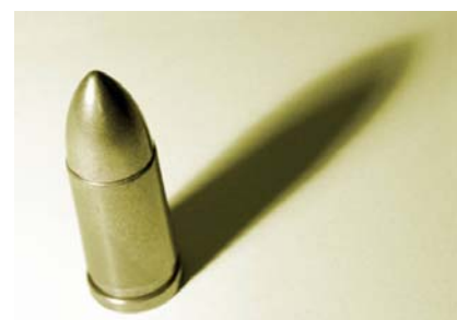
Silver: the magic bullet?

At the close of the meeting a number of consensus statements were proposed regarding the use of silver-containing dressings. These consensus statements will be published in the November 2005 issue of Primary Intention for AWMA/state members to comment on. The entire edition of the November 2005 Primary Intention will be devoted to exploring the silver-containing dressing phenomenon.